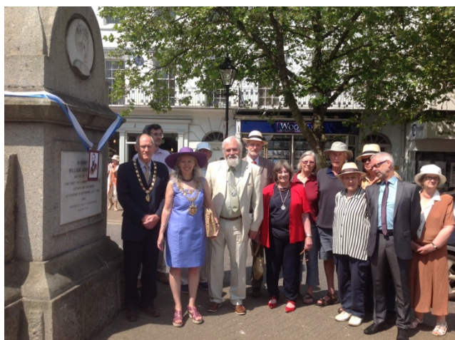
Totnes Mayor and Town Councillors at the Totnes Wills Memorial, 21 June 2014

The Totnes Memorial remains today in its original place, unlike our own Burke and Wills Statue, which has had successive moves around Melbourne to its present location on the footpath in Swanston Street.