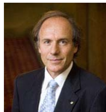
Pictured: Dr Alan Finkel AM RSV Trustee & Chief Scientist of Australia (designate)

We will align with, convene and develop a diverse, engaged community of STEM educators, researchers, communicators, campaigners, innovators, entrepreneurs and business leaders in Victoria to better realise a prosperous, sustainable, knowledge-based economy across our State .