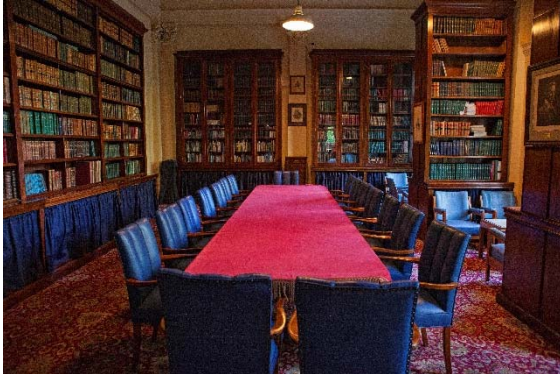
Pictured: The beautiful Cudmore Library at the RSV

We must extend the capacity of the Society to commission, support and celebrate the advancement of science through philanthropy, partnerships, sponsorships and grants.