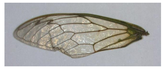
A cicada's wing, providing the model for a bactericidal nanosurface for reproduction in clinical settings.

cell that came into contact with nanopillars on the wing (the miniscule peaks on the surface) was subject to high stress, leading to the membrane being sheared apart. The bactericidal nature of cicada wings, however, was limited to killing gram-negative bacteria but not gram-positive bacteria. All bacterial species can be classified as either gram-negative (e.g. E. coli ) or grampositive (e.g. Staphylococcus aureus ) depending on the composition of their cell membrane, making this innate distinction in bactericidal ability intriguing.