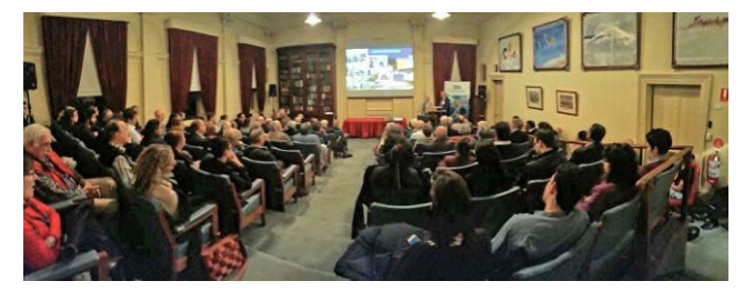
Professor Ivanova presenting to the RSV audience.

The nanopattern of the wings can be etched into black silicon wafers – a synthetic analogue of dragonfly wings – to kill bacteria to the same degree as the wings, or even better. She also attempted to recrystallise the fatty acids found in insect wings on graphite, and this scientific curiosity lead to the creation of another bactericidal surface.