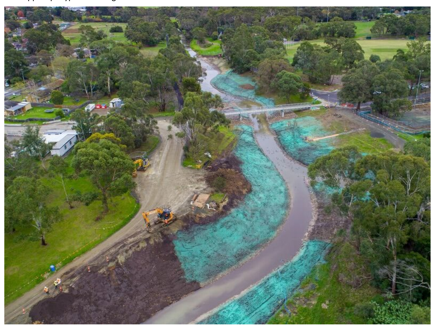
Daylighting Dandenong Creek.

An exciting innovation is that Melbourne Water, together with Yarra Ranges Council and South East Water, are developing a smart rainwater tank using 'Tank Talk' flow control technology that enables water to be released remotely to the creek network. The flow of water into creeks at critical times aims to support stream health which can support platypus breeding.<sup>18</sup>