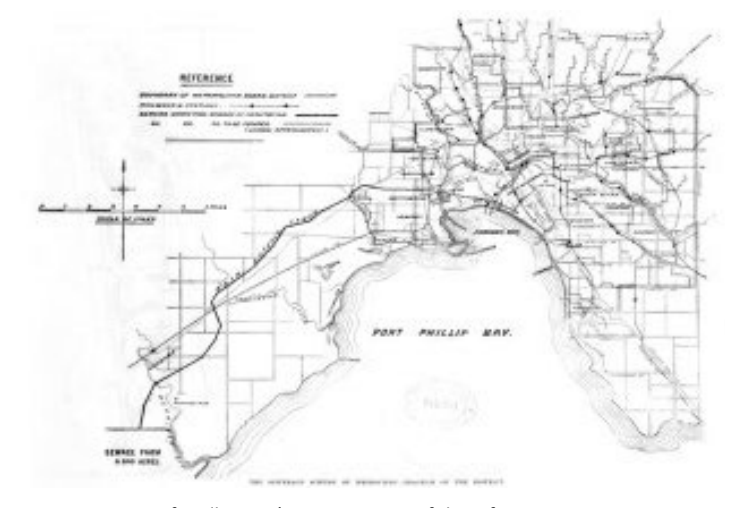
An 1892 map of Melbourne's sewers. Most of the infrastructure remains in place.

Whilst climate change presents an existential threat to the platypus, the actions of humans have also impacted the species. In the years following Napoleon's viewing of the platypus, a European settlement grew on the banks of the Yarra River in Port Phillip Bay which began to encroach on an ecosystem that had sustained the local Kulin Nation for thousands of years. Melbourne's creeks and wetlands provided a rich food bowl for the Wurundjeri and Bunurong peoples of the Kulin Nation. Kooyang , in late summer, was known as the season of eels. The seasonal rainfalls also sustained the local platypus population, which was able to move along creek beds, billabongs and wetlands to breed.