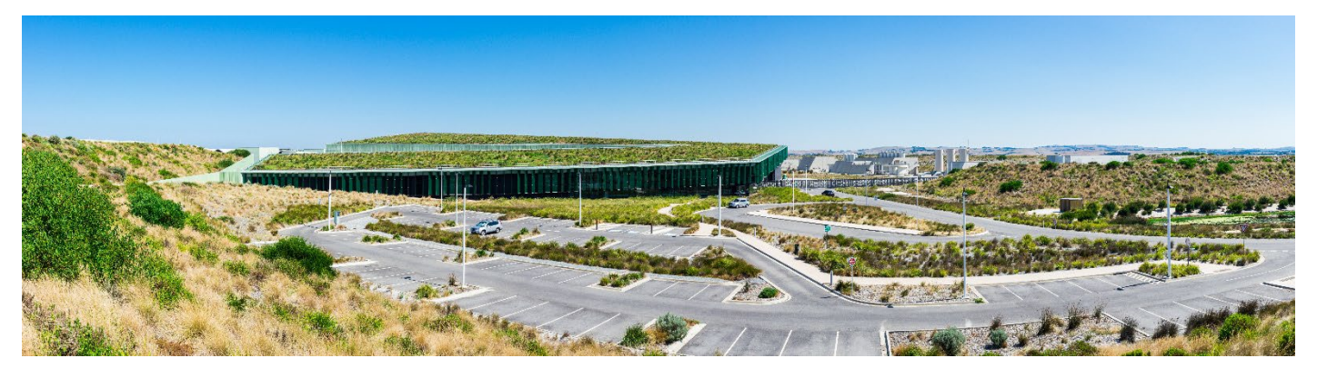
The Victorian Desalination Plant at Wonthaggi was completed in 2012. It can produce 410 megalitres of water per day.

The platypus is the poster child for water scarcity and variability because it relies on reliable water for its very survival. The reality of climate change is that there is increased likelihood that there will be times of water scarcity and times of intense rainfall events. Both events pose threats to the platypus. Whilst financial systems cannot alter when and where it rains, there is the potential to reduce conflict amongst stakeholders who have competing interests, and more specifically to guarantee the supply of water for biodiversity through new investment models.